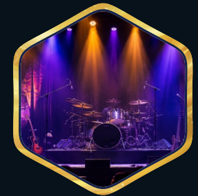
LIGHT & SOUND